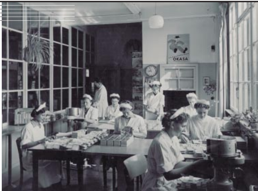
The Horphag factory control department (pictured here in 1956)